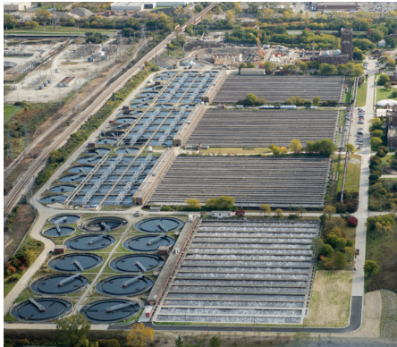
O'Brien Water Reclamation Plant

The Terrence J. O'Brien Water Reclamation Plant (WRP) is one of seven wastewater treatment facilities owned and operated by the Metropolitan Water Reclamation District of Greater Chicago (MWRD). The MWRD is the wastewater treatment and stormwater management agency for the City of Chicago and 125 Cook County communities. We work every day to mitigate flooding and convert wastewater into valuable resources like clean water, phosphorus, biosolids and natural gas.