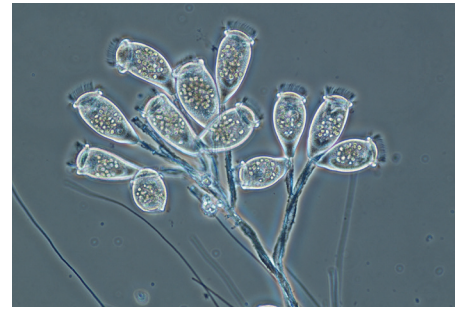
Microbes such as these stalked ciliates help remove bacteria and organic material from the water in secondary treatment.

How do we know we're doing a good job? Wastewater treatment facilities are regulated under the Environmental Protection Agency's National Pollutant Discharge Elimination System (NPDES) permit program. NPDES permits set rigorous standards that the water from the plant must meet. The National Association of Clean Water Agencies has given the O'Brien WRP the association's highest awards for compliance with these standards. We also see the benefits of our work resulting in increased recreation on the waterways, such as kayaking and canoeing, a rebounding aquatic habitat and increases in fish species. We're reducing energy use at our facilities with a goal of reducing greenhouse gas emissions, and we're recovering valuable resources and expanding the use of biosolids throughout the region.